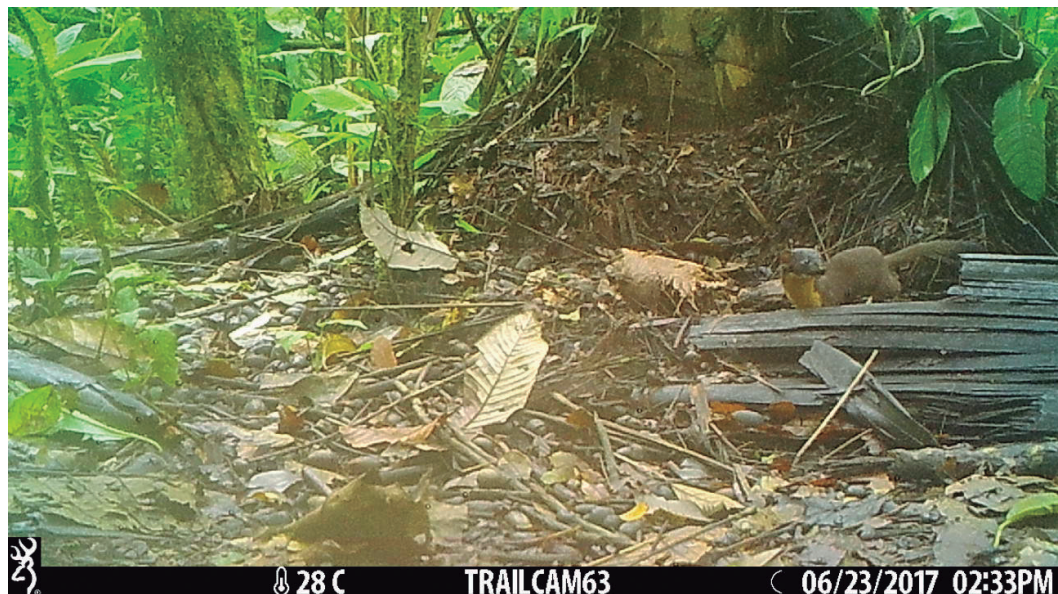
FIGURE 2. Still image extracted from a 10-second camera-trap video taken at the Bilsa Biological Station (00°0'48" S, 79°42'42" W, 512 m), located in the Mache-Chindul Ecological Reserve in the northwestern Ecuadorian province of Esmeraldas.

Here, we report the first confirmed record for the N. frenata in the coastal lowlands of western Ecuador based on a photograph and a video (10 seconds of footage) of one individual (Figure 2) taken on 23 June 2017 at 14:33 hours. The N. frenata individual crossed the field of view of the camera quickly before passing out of sight.