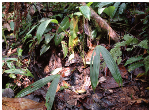
Ripe fruits hang from a chapil palm, far left. About an hour after a long-wattled umbrellabird eats a chapil fruit, it regurgitates the seed, middle left. Where seeds land, chapil seedlings may sprout, near left.